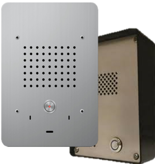
Image above shows flush fit and bulkhead / wall mount AP-10-04 execution options. The unit can be silk screened with legends / text in accordance with client requirements (eg multi lingual instructions)

The unit is designed to provide service in harsh conditions; for example on board drilling installations or in a marine environment where reliable operation is prime requirement. The enclosure can be dimensioned to suit client specification. Where space is restricted or where a special fascia plate foot print is required we are able to tailor the enclosure to meet project specific requirements. The unit can be supplied either flush fit or surface mounting and is available with client specified RAL paint finish if required.