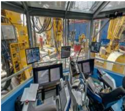
DMU-01 module is installed inside MT50 central equipment

The Zitel MT50 talk back intercom system is designed to provide reliable efficient two way communications in a drilling rig environment. The system eliminates complex call plans and flimsy key pad human machine interfaces in favour of robust simple hardware designed to survive the aggressive operational conditions commonly found on a drilling rig installation. For certain applications the driller's control room is often equipped with dual chairs – Driller and Assistant Driller positions and in such instances dual master talk back controls are required. An MT50 driller's talk back central panel can be equipped with a DMU-01 module which then allows the connection of dedicated MG600Exi hazardous area goose neck mounted microphones and explosion proof system control paddle switches assigned to each chair.