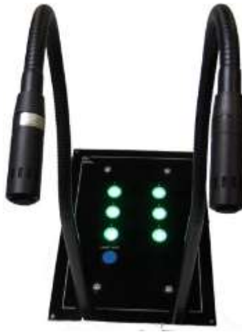
Typical Explosion proof 'dual chair' driller / assistant driller access panel, customised to client specification.