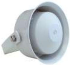
HS8EXMNT explosion proof loudspeaker – receives speech from the monkey board