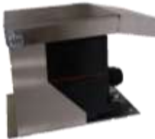
FKS01Ex explosion proof actuator designed to control the talk back system on a hands free basis.