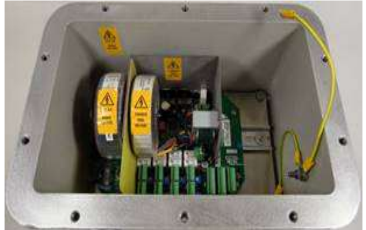
The MT50 base model is explosion proof and designed for use in Zone 1 hazardous areas