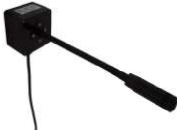
MG600Exi intrinsically safe microphone transmits voice to Monkey board

Drilling control house talkback facilities usually have to squeeze into confined spaces and use available room. Essential intercom components are shown above and are designed to survive drilling operations and each is certified for safe use in a potentially explosive atmosphere