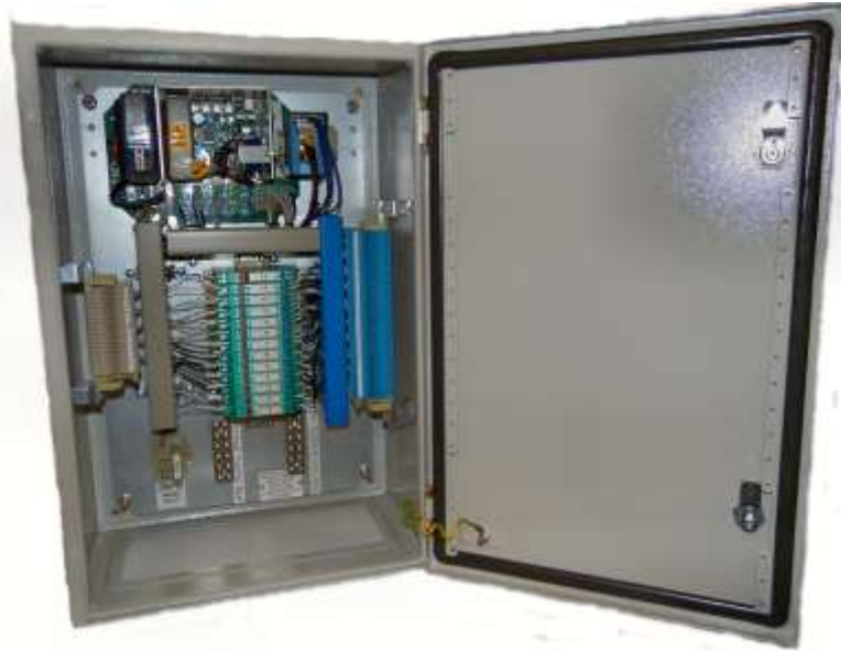
The MT50-W is IP55 rated and is designed for safe area location

Both Zone 1 hazardous area and safe area MT50 units are available, both feature a space saving compact design.