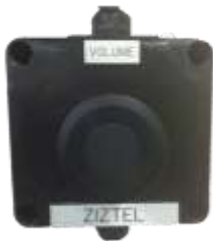
Explosion proof push button incremental volume control sets receive volume to Driller's loudspeaker